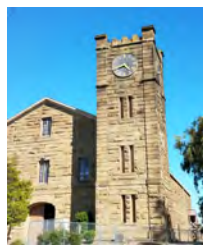
4 Clock Tower (1859)

Difficulty Moderate Distance 4.5 Miles Type Loop Time 35 minutes