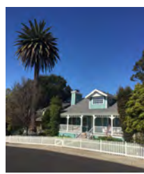
1 Officer's Home (early 1900's)

More information at beniciahistoricalmuseum.org