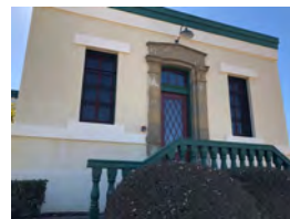
5 Guard House (1872)