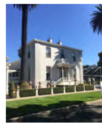
2 Jefferson Street Mansion (Lieutenant's House)(1863)