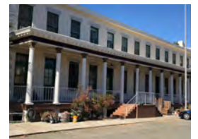
6 Bachelor's Quarters (1872)