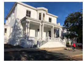
3 Commanding Officer's House (1860)

to continue on Jefferson Street dismount and walk bike through passageway or drop down to Adams Street to continue on route