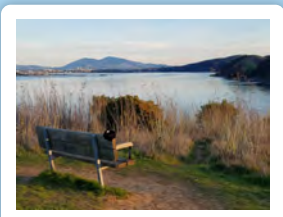
Looking east to Mount Diablo